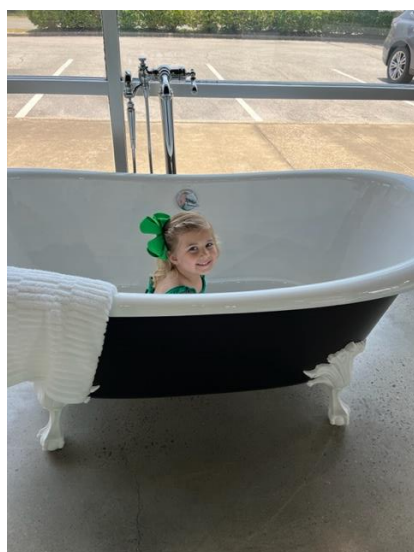
You're never too young to enjoy a Kohler bath!